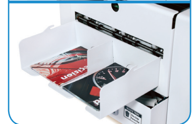
Adjustable catch tray keeps cards neatly stacked