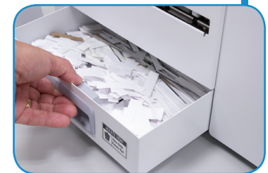
Waste bin collects paper scraps and is easy to empty

BINDING & LAMINATING SOUTHWEST COME TOGETHER. RIGHT NOW.