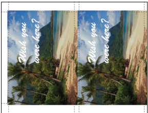
2-up 5" x 7" postcards Optional FC-10 - 7" Cassette