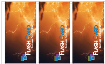
3-up 4.25" x 8" postcards Optional FC-20 - 8" Cassette