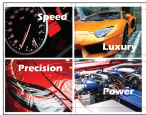
4-up 3.5" x 5" postcards Standard FC-05 - 3.5" Cassette